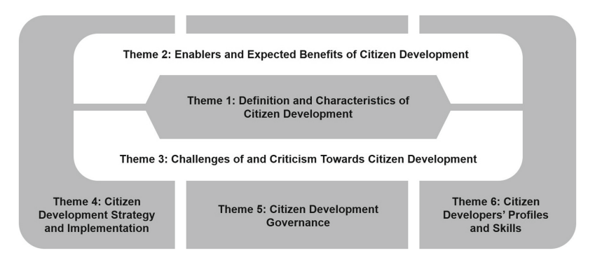
Fig. 2. Conceptual model of current literature themes on citizen development.

We analyzed our data set according to the recommendations of Webster and Watson [26] and vom Brocke et al. [31]. We initially captured all 79 articles of our sample into a table. For literature analysis and synthesis, we pursued a two-step approach. In a first step, the first author carefully read and analyzed each article by identifying and systematically extracting the topics and underlying rationales that surfaced in the respective article. Hence, our process of topic extraction is interpretive in nature. To obtain a comprehensive perspective on the citizen development phenomenon, the first author subsequently searched for interrelationships among these topics in a second step. Identical and interrelated topics were grouped together, leading to the formulation of six key themes. In cases of unclear group assignments, doubts were clarified in discussion with the second author. Figure 2 illustrates the six key themes that emerged from our analysis. In the following, we present our findings by delineating and outlining each theme.