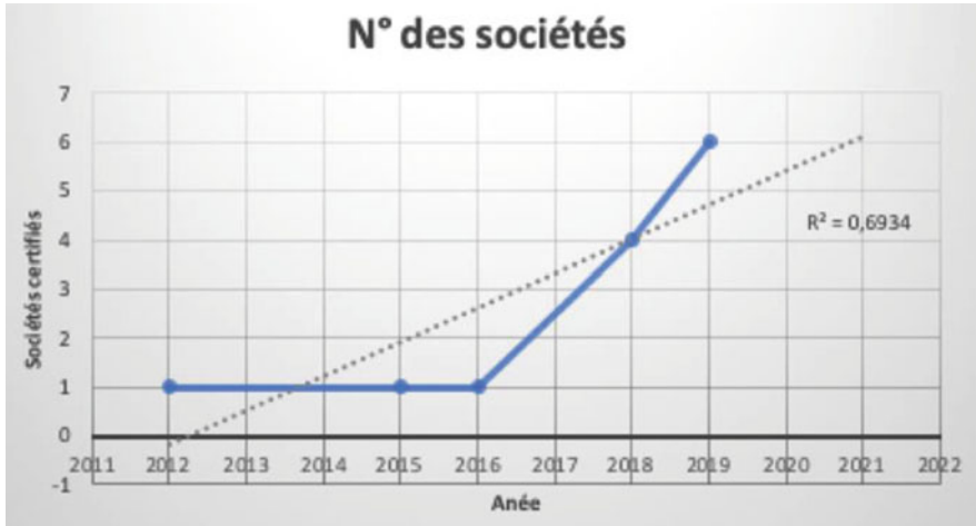
Fig. 1 Number of B-Corp per year