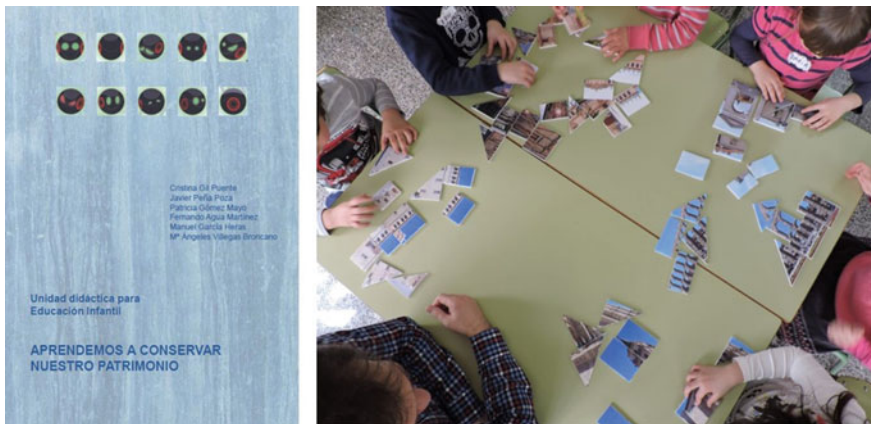
Fig. 12.1 Cover of the childhood education didactic unit (left) and practical implementation in a public school (right)

The didactic unit for Childhood education (Fig. 12.1 left) was divided into five sessions and included a complete set of work documents, a notebook for teachers and an annex of images for helping teachers at all times. The practical part of the unit was implemented in an educational center at Alcalá de Henares (Madrid, Spain): the García Lorca public school (Fig. 12.1 right). The didactic unit for Primary/Secondary education (Fig. 12.2 left) was also divided into five sessions and also included a set of work documents, along with a notebook for teachers and an annex of images. In this case the practical part of the unit was more widely implemented in three educational centers located in the autonomous community