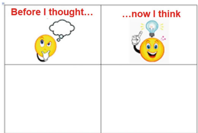
Fig. 12.4 “Before I thought, now I think” routines

Next, the students will be asked to carry out a small investigation about a cultural good located in their immediate surroundings. In the making of this investigation they should take some photographs of the cultural good chosen, look for some information on Internet and social media and ask other people for their opinion about this cultural good. They should evaluate visually also its state of conservation. Finally, the students will have to publish their results with the help of graphic materials in a physical or digital panel enabled by the education center.