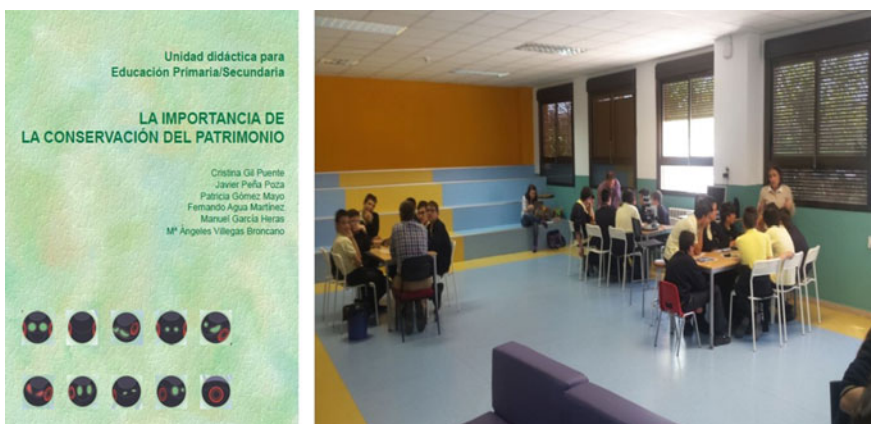
Fig. 12.2 Cover of the primary/secondary education unit (left) and practical implementation in one of the schools (right)