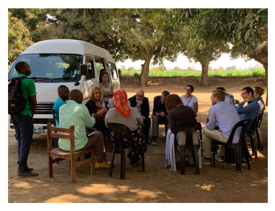
Fig. 3 Meeting at the "25 de Setembro" agriculture cooperative, Boane, August 2019.

informal settings, allowing the respondents and the researchers to interact freely and add issues and questions during the conversations (See Fig. 3). This allowed the team to assess and re-orient the early findings and insights as regards the territory of the study.