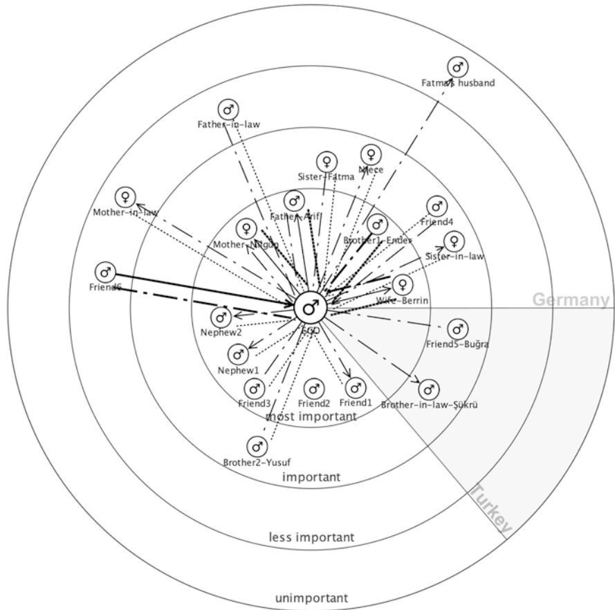
Fig. 8.2 Bora’s network map

that I need to be prepared all the time. When my children were younger, they were coming home from school hungry. I needed to feed them and with good meals, so that they can grow up and concentrate on their schools and be successful. Back then my husband was earning good money, we could spend but also save some of it. This requires also a lot of organizing all around, so that children have a regularity [...] Sometimes we hear children who could not keep up with the school here [in Germany], they go out, drink alcohol, use drugs. Who wants these things for their children? Nobody, of course! But for that not to happen you need to work at home hard. A neat family environment is needed, so I made a nice home with good food, clean and safe environment. [...] My husband has never hit my children which is very common in other families I hear. For us, our children’s well-being and success is the most important [...] This is how we brought up our children, and it even continues today, when they need any help they come to us and when we need help we go to them. I feel responsible to make sure everyone feels this familyhood and being supported because we live in another country, it is already very difficult but we all have each other’s back. [...] Sometimes if they cannot really tell to their sister or brothers what they need, if one of them has more, I make sure that they all share what they have and help the one in need.’