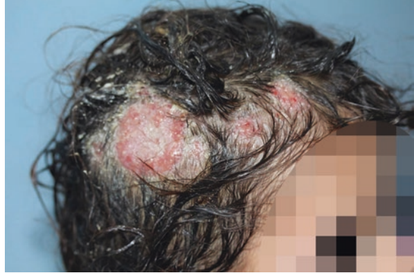
Fig. 56.2 An erythematous and inflammatory patch on the right temporal region. Multiple pustules are observed

Fig. 56.1 Five alopecic plaques ( 5 \times 5 , 3 \times 2 , 0.5 \times 0.3 , 0.5 \times 0.2 , and 1 \times 1 cm) on the right temporal area. On the frontal region, a solitary plaque ( 1 \times 1 cm) is observed. All the plaques are covered with yellow adherent crusts