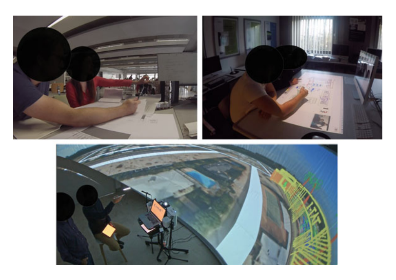
Fig. 1 Example each of the three critique type: a desk critique (up, left), a CDS critique (up, right) and a Hyve-3D critique (down)

The first case study is a traditional desk critique where students and tutors used printed plans and sections, as well as physical mock-ups during the critique. Students were master architecture students at the Graduate School of Architecture Nantes (France). The observations took place during the 2018 Spring semester. The requirements were to integrate public equipment into a housing complex, and to develop high environmental quality designs. The concept was developed by students individually using a series of conceptual mock-ups. The sessions observed took place following the selection of an architectural concept. During these critiques, students use concept mock-ups they had previously developed as a representational ecosystem as well as a set of other representations, plans, sections, perspectives drawings. Three students were observed during three critiques in a row. Each critique lasted between 30 and 60 min.