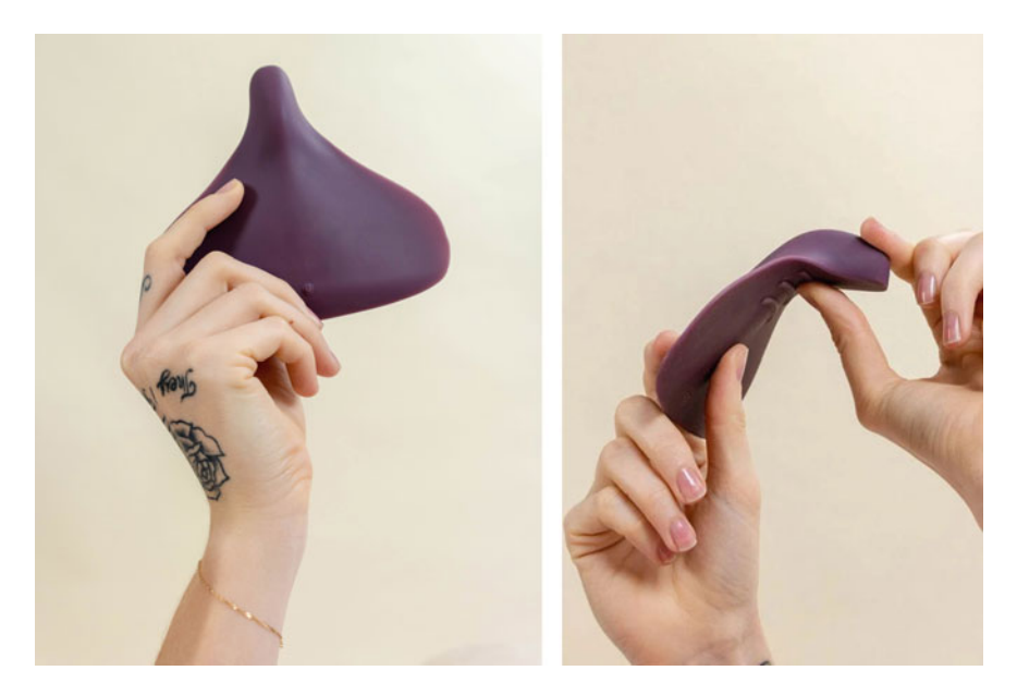
Fig. 2 Enby product designed by Wild Flowers, 2019. Image taken from: https://wildflowersex. com/products/enby. Access: August 10, 2019