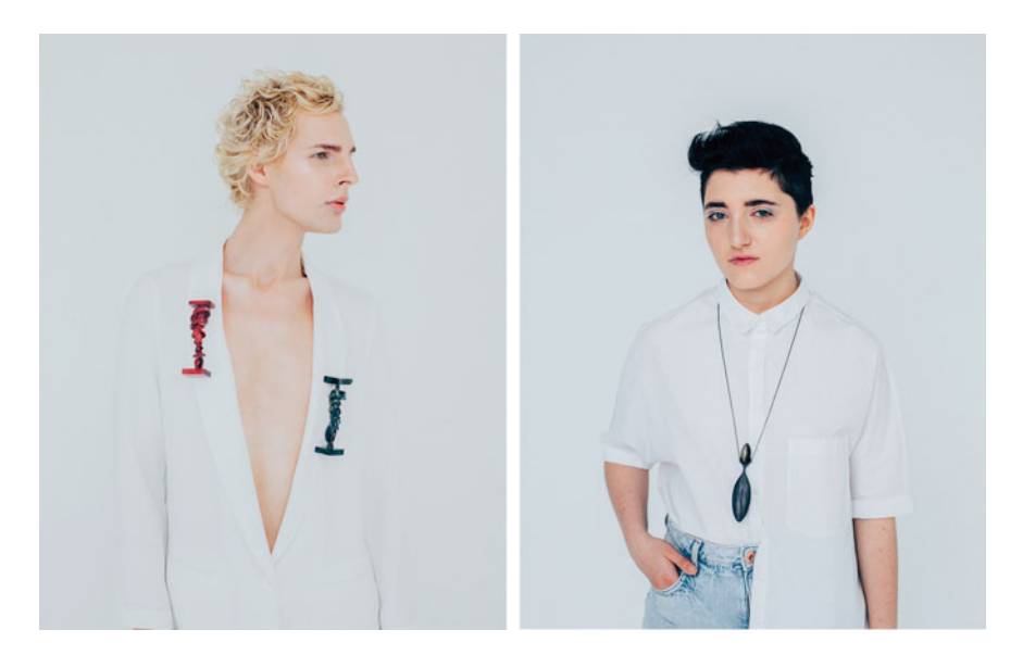
Fig. 4 From left to right. Metanoia V and Metanoia VI breast pin and Fazis I pendant by Darja Popolitova, 2015.