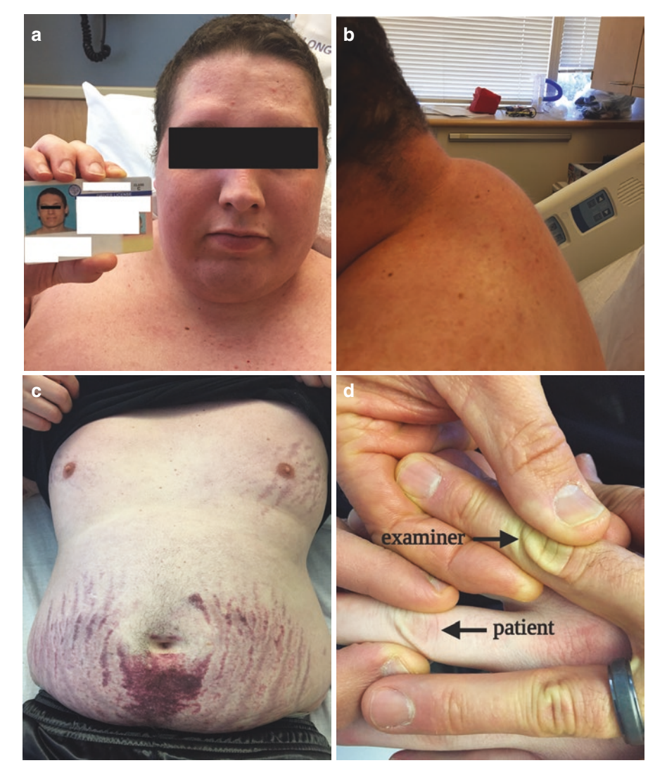
Fig. 3.1 Physical exam (photographs). Moon facies and facial plethora (a). Dorsocervical and supraclavicular fat pads (b). Abdominal bruising and purple striae (c). Finger decreased skin fold thickness; patient compared with examiner (d). Obtained with patient consent/permission.

Physical examination (Fig. 3.1) was remarkable for hypertension (blood pressure; BP 146/107 mm Hg), obesity (body mass index; BMI 35), moon facies, facial plethora, mild acne, dorsocervical and supraclavicular fat pads, decreased skin fold thickness, abdominal bruising, and purple striae. Based on clinical presentation, it was suspected that this patient had excess cortisol production or Cushing's syndrome (CS).