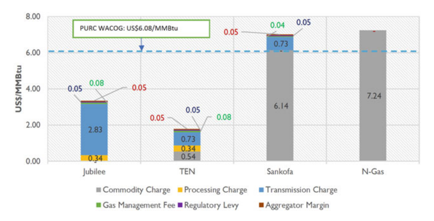
Fig. 2 Ghana's gas pricing for the different sources

of oil equivalent are certified.<sup>53</sup> Contingent resource estimates provided are 111.5 million barrels of oil equivalent for Jubilee and 230.3 million barrels of oil equivalent for the TEN fields.<sup>54</sup>