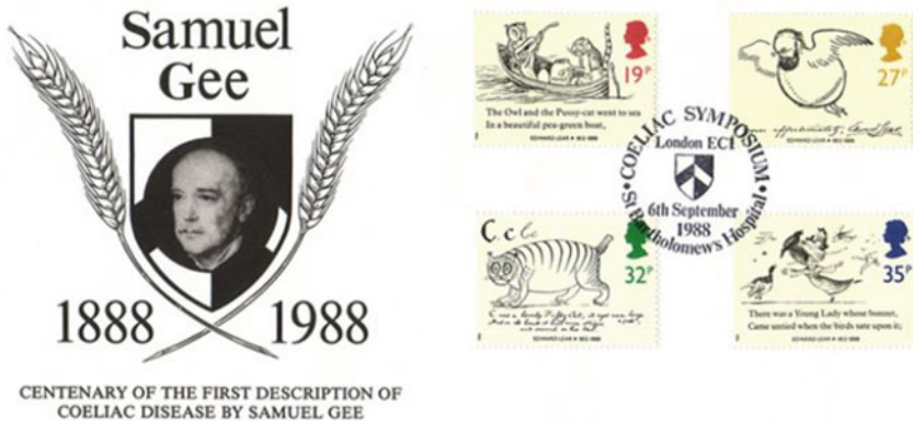
Fig. 2 Special edition of envelope and stamps on the occasion of the Samuel Gee symposium (London, 1988, organized by John Walker-Smith)

positivity, in particular for IgA antibodies to tissue transglutaminase 2 (tTG) and antiendomysial (EMA) IgA antibodies [9]. As these serological markers are not 100% specific for detecting intestinal lesions compatible with CD, positive celiac serology is confirmed by duodenal biopsies demonstrating the hallmark pathological changes of mucosal remodelling, such as villous atrophy, crypt hyperplasia and intraepithelial lymphocytosis [12].