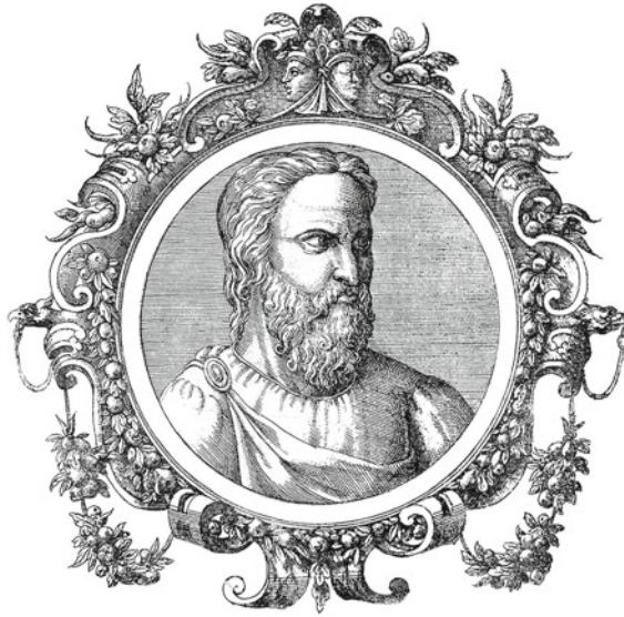
Fig. 1 Aretaeus of Cappadocia