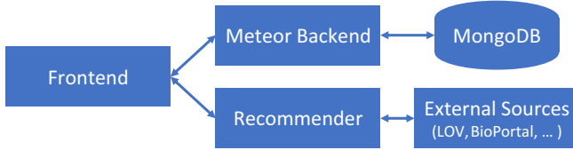
Fig. 2. Neologism 2.0’s frontend communicates with a backend to persist information, and might interact with a recommender to improve the quality of drafted vocabularies.

REST endpoints for edit operations on classes and properties. As a major feature, Neologism 2.0 immediately synchronizes changes among all clients and the server to enable real-time collaboration, which avoids confusion among users caused by asynchronous edits.