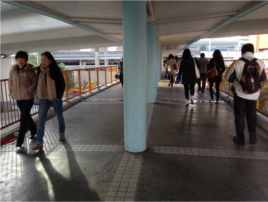
Fig. 3. The pillars are considered to represent ‘railings’ that separate the pedestrian bridge into two parts and avoid crowds becoming chaotic.

(Fig. 4 and Fig. 5). Indeed, as all individuals are involved in social relations, they quickly learn from each other via social norms and individual practice. In general, the bus stop sign is deemed the starting point of the ‘railing’. No one would risk stepping over it, because those who jump the queue would be ejected for their unethical behaviour and severely criticized by others. Moreover, in Hong Kong, only a few buses share the same bus stop, enabling people to queue without crowding. In this case, product intervention is less necessary because people have achieved spontaneous sustainable behaviour (i.e., positive practices) without the need to impose restrictions. However, in some cases, such as a bus stop located in the middle of road, interventions are necessary to prevent people (e.g., children or the elderly) from accidentally entering the vehicle stream.