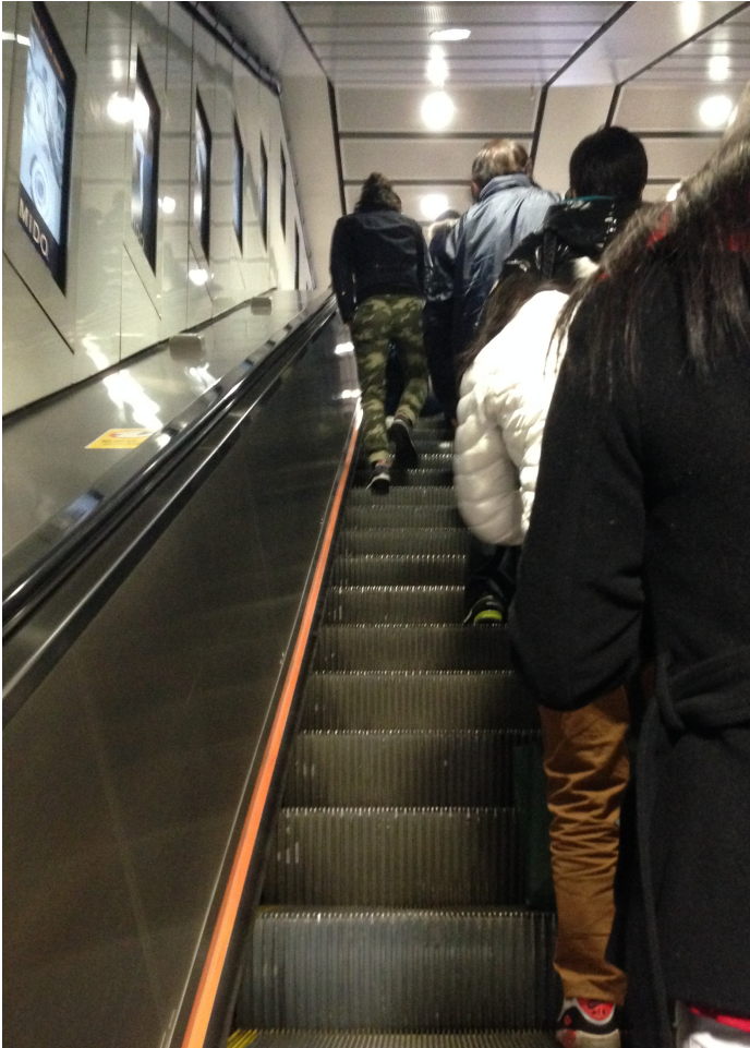
Fig. 2. An ‘intangible railing’ divides escalator space into two parts