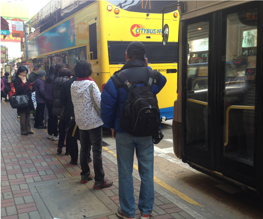
Fig. 5. People standing in line waiting for buses, even in the absence of railings. They have clearly formed a sustainable practice of waiting in line with or without railings.

As both social contexts and human behaviour are complex and dynamic, designers should shift their focus onto practices rather than products. Nowadays, some researchers propose ‘practice orientation’, which focuses on investigating user behaviour in social practice as an effective approach to designing appropriate strategies to suit the dynamic social context. Although people learn from each other, the actions (i.e., practices) of individuals differ due to personal perspectives and attitudes. The variety of human behaviour demonstrates that it is impossible to insist on a static way to deal with a constantly changing situation. As user practices and social norms are not constant across space and time, flexibility should be considered as a form of sustainability in the design process. In other words, a product that was suitable and met people’s requirements in the past may not serve the public interest in the present. Similarly, practices people previously rejected may be deemed totally accepted in the current situation, and vice versa.