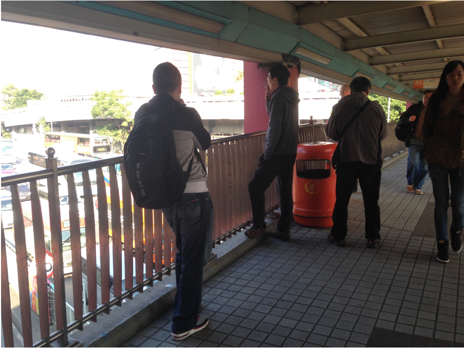
Fig. 6. A rubbish bin, together with a small area nearby separating a smoking area from public space. Smokers are willing to stand close to rubbish bins because of the convenience of disposing of their cigarette ash.

approach, designers should aim to understand the complex and dynamic social interactions between users, objects and society, rather than focusing on individual products (Fig. 7). Simply speaking, ‘product’ is a ‘noun’ and practice is a ‘verb’. For example, if we consider a product such as a cup, merely focusing on the shape of a cup, even when considering usability and user experience, will produce a design outcome that is no more than a utensil. If we focus on drinking, however, a variety of options arise, such as by hand, paper, a straw. As a result, an innovative straw with a filter, namely ‘Lifestraw’, was designed for some areas in Africa to drink water directly from a freshwater lake. This solution was by no means without foundation, but rather more reliant on the findings from everyday user practices. In other words, designers should shift their focus from ‘product’ to ‘practice’ to explore how people interact with public facilities in different situations (spatiotemporally), and then design appropriate interventions to influence user behaviour.