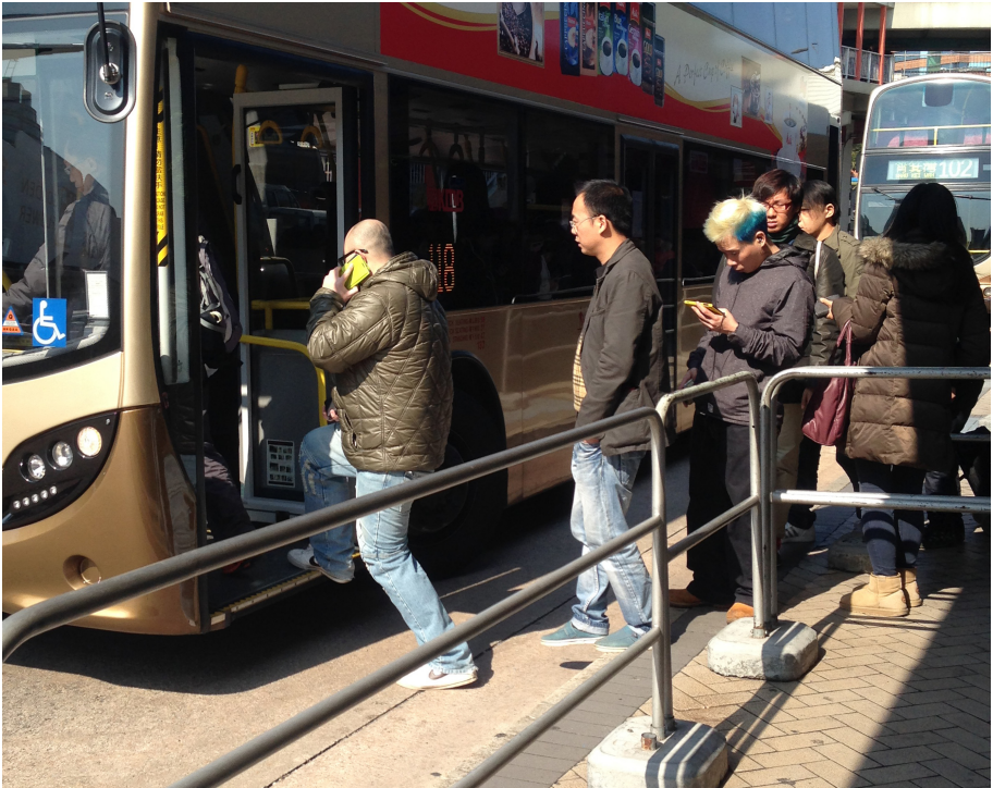
Fig. 4. People standing in line to board a bus with the intervention of railings.

similar to a designated area with a sign stating ‘smoking area’, gives the impression that smoking is allowed in this area. Hence, to reduce the smoking rate in a specific area, we could deliberately remove the rubbish bin to increase the difficulty of accessing one. However, we would need to balance the relationship between intervention and user acceptance. Inappropriate controls (interventions) may lead to overwhelming annoyance or irritation. In these circumstances, decreasing the distribution density of rubbish bins may be considered a gentler form of persuasive intervention.