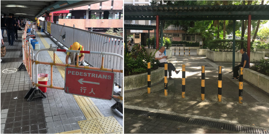
Fig. 1. Tangible interventions set up to prevent the entry of pedestrians (left) and bicycles (right)

In public spaces, tangible interventions can be seen everywhere. For instance, workers erect temporary railings during road repairs to prevent pedestrians from endangering themselves. Railings are sometimes set up in streets to guide people to behave appropriately. Bollards are often installed at the entrances to open spaces to prevent the entry of bicycles, even though this overlooks the accessibility and satisfaction of certain city users, such as people with disabilities, and especially those with visual impairment, for whom they are inconvenient or even dangerous (see Fig. 1).