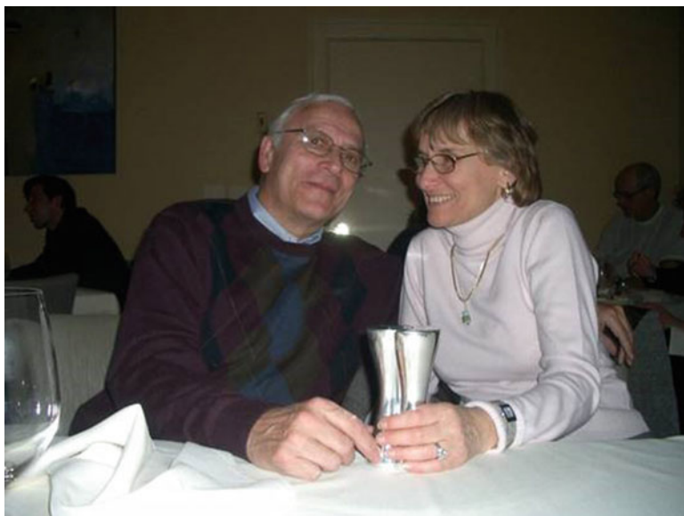
Fig. 36.14 Minneapolis, February 2007