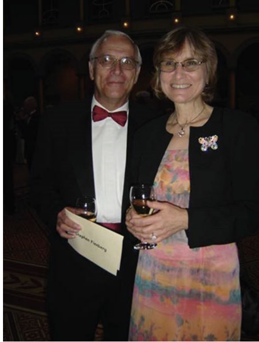
Fig. 36.18 National Academies' annual gala, date unknown.