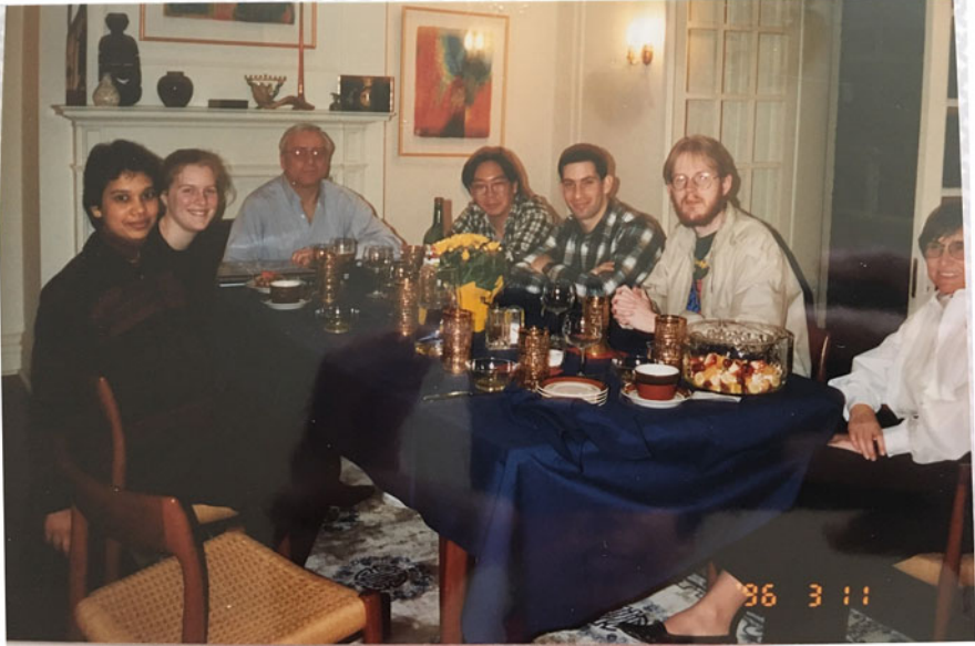
Fig. 36.4 Gathering at the Fienbergs' home with statistics graduate students; Spring, 1996