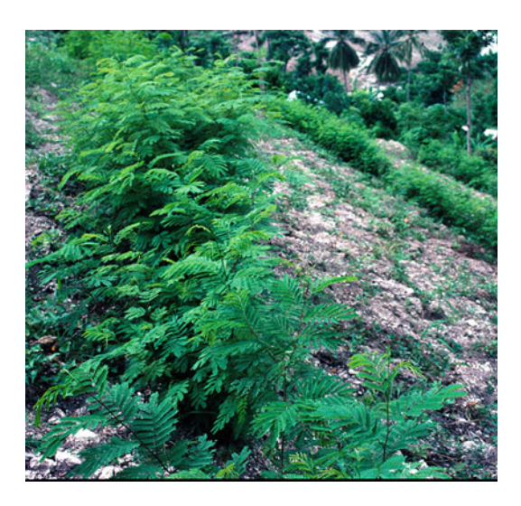
Figure 6.7 Contour hedgerows of Leucaena leucoce phala for soil conservation in Haiti. (See also Chapter 18, Figure 18.17 from Haiti, and Figures 18.9, 18.10, and 18.11, and 18.12 from other countries).

crop husbandry practices are important in determining the success of the alley cropping system.