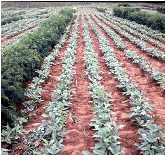
Figure 6.5 Alley cropping: Senna siamea – Machakos, Kenya.

conditions and numerous conceptual and researchbased publications on the topic were produced during the 1980s and 1990s (Kang et al. 1990, 1999; Nair 1990; Kang 1993, 1997; Akeyampong et al. 1995; Sanchez 1995; Jama et al. 1995; Cooper et al. 1966; Rao et al. 1998). Biophysical aspects were the thrust of much of the research in alley cropping; these results are summarized in this chapter.