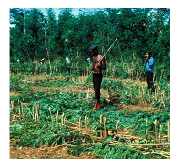
Figure 6.2 Alley cropping: Gliricidia - Early (1980) trials at IITA, Nigeria.