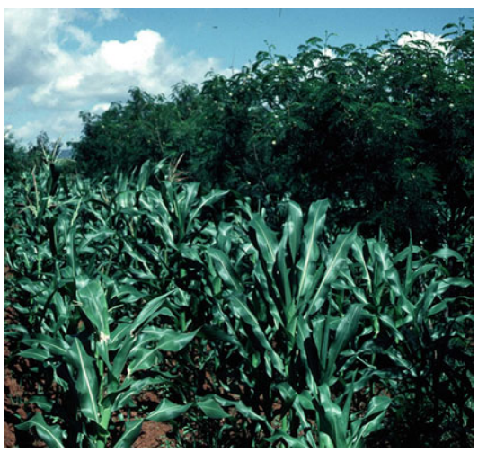
Figure 6.4 Alley cropping: Leucaena – Machakos, Kenya.