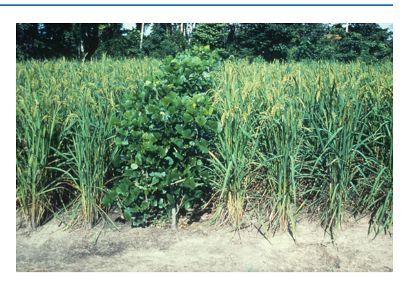
Figure 6.6 Alley cropping: Acid Soil at Yurimaguas, Peru – Dactyladenia barterii.