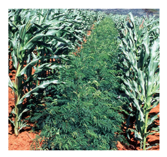
Figure 6.3 Alley cropping: Leucaena – Machakos, Kenya.

conditions and numerous conceptual and researchbased publications on the topic were produced during the 1980s and 1990s (Kang et al. 1990, 1999; Nair 1990; Kang 1993, 1997; Akeyampong et al. 1995; Sanchez 1995; Jama et al. 1995; Cooper et al. 1966; Rao et al. 1998). Biophysical aspects were the thrust of much of the research in alley cropping; these results are summarized in this chapter.