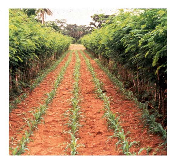
Figure 6.1 Alley cropping: Gliricidia - Early (1980) trials at IITA, Nigeria.

Pioneering work on this technology was initiated at the International Institute of Tropical Agriculture (IITA), in Nigeria, during the early 1980s. As a newly minted technology, alley cropping generated a lot of interest among researchers and development professionals and it was portrayed as a viable alternative to the traditional bush-fallow system. The practice has been tried and evaluated in many parts of the tropics under a variety of soil- and climatic conditions (Figures 6.1, 6.2, 6.3, 6.4, 6.5, and 6.6). The technology, originally developed as an approach to enhancing crop production in areas of West Africa dominated by the traditional bush-fallow system, was soon extended to fodder production systems (by using fodder tree and shrub species as hedgerows and for erosion control on sloping lands (by using contour-aligned hedgerows as live barriers to erosion: Figure 6.7). The potential of alley cropping for reaping such benefits have been investigated under several agroclimatic