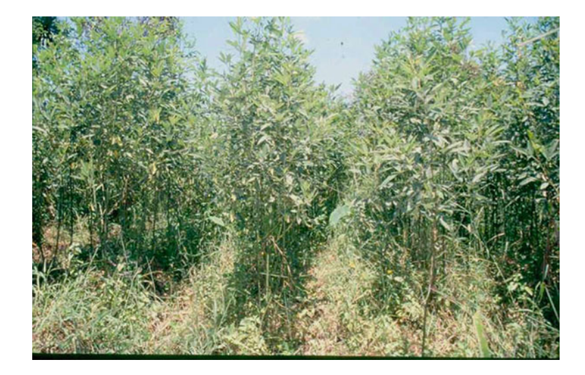
Figure 6.10 Improved fallow: One-year-old Cajanus cajan fallow, Zambia.