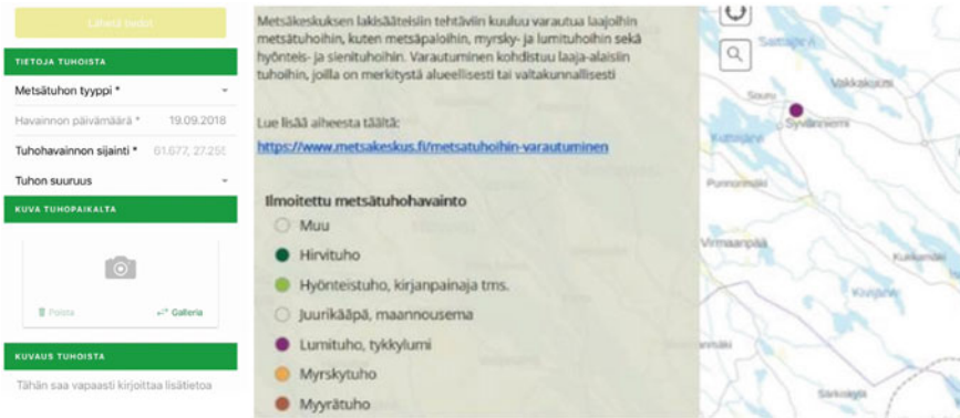
Fig. 23.3 Example of Laatumetsä mobile solution with related map service

2019, and it was mainly a technical solution improvement activity and therefore not visible for the end users.