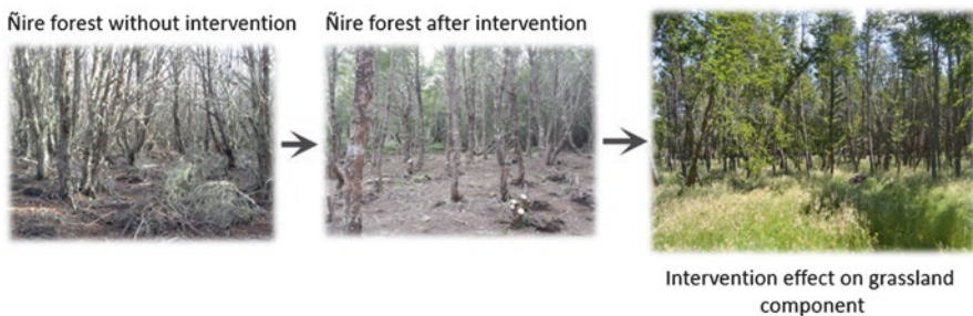
Fig. 6.2 Illustration of a typical silvopastoral system in ñire forest of the region of Aysén, Chile

The territory of the Aysén Region represents a recent history of colonization (Ortega and Brüning 2004), which has transformed large extensions of deciduous lenga and ñire forests into rangelands and scattered fragments of these native forests (Veblen et al. 1996, Sanchez et al. 2011). Thus, cattle ranching constitutes the basis of deep-rooted traditions in the local population since the beginning of colonization (Ortega and Brüning 2004). The use of the forest by livestock producers is associated with partial cutting for firewood (energy use), creating canopy openings that increase understory biomass for cattle grazing (Fig. 6.2). The occupation of the forest by cattle is not continuous and permanent, but it is accentuated in dry seasons with very hot summers or winters with very cold temperatures, where the use of the forest provides comfort to the cattle. Thus, the system of livestock uses lenga forests in summer and ñire forests in winter.