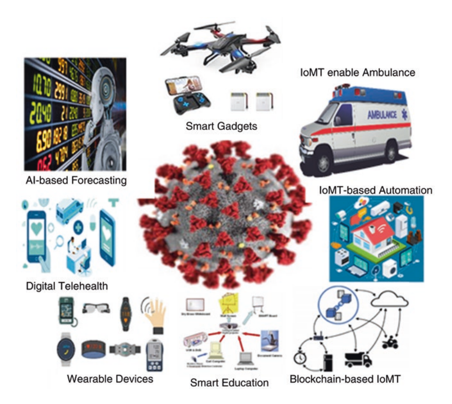
Fig. 8.1 Prospective applications of IoT to combat COVID-19

The IoMT is the expanded health-specific edition of the Internet of Things (IoT) [12]. Introduced to the present situation can be used to build a social forum to help individuals access appropriate treatment at home and to develop a robust repository