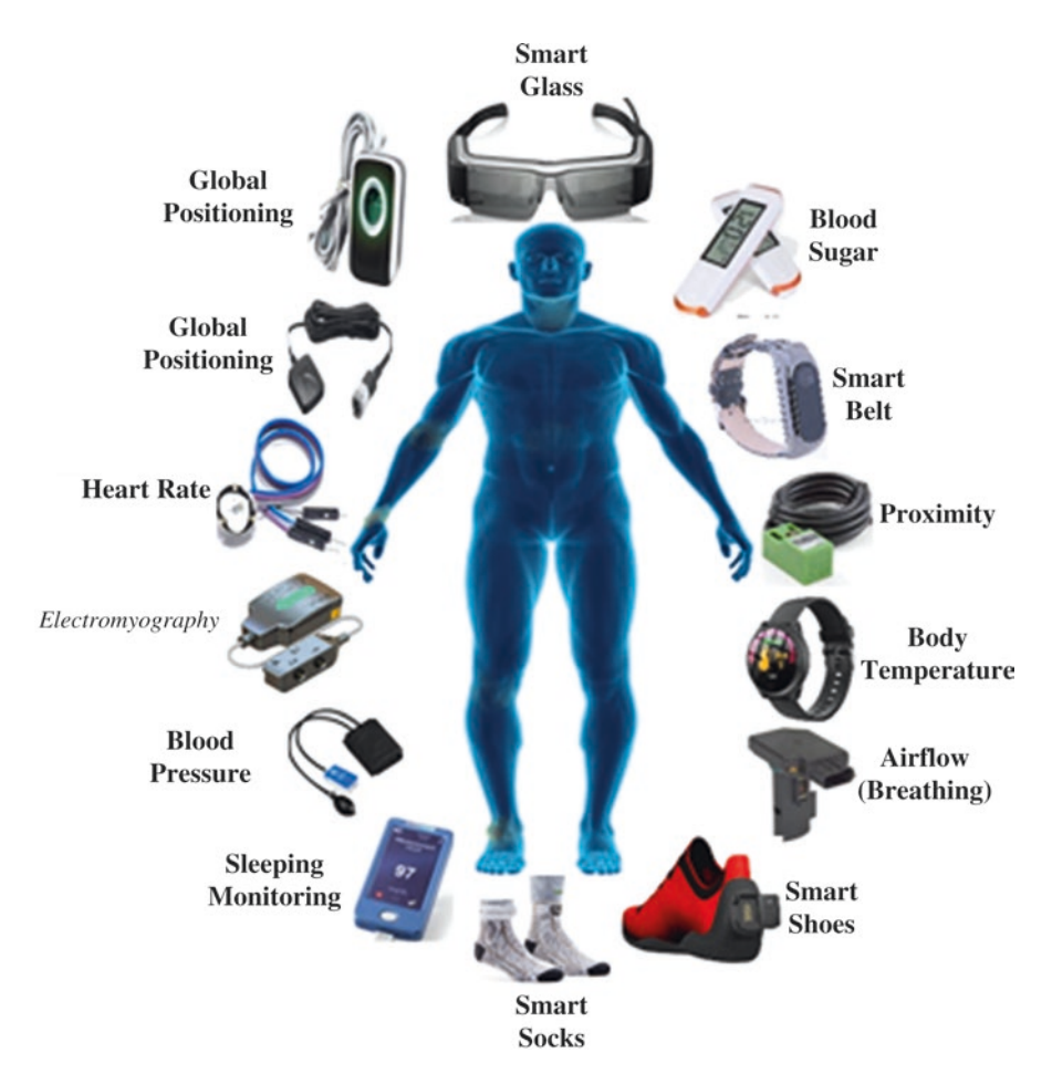
Fig. 8.2 Selected worthwhile sensor devices for collection data on IoT during COVID-19

This has really helped and changed the outlook of smart healthcare technology in recent years with introduction of various devices and sensors that can be embedded and implanted in human body. As applied to biomedical technology, this is known as biomedical sensor wireless networks (BWBSNs) [43, 44]. The WBSN allows for the embedding of low-power, remotely controlled smart ubiquitous sensor nodes to track body systems and their surroundings. Every node can detect, track, and send data to the Super Sensor. During the COVID-19 pandemic, selected sensors used in IoT for information collection and monitoring are depicted in Fig. 8.2.