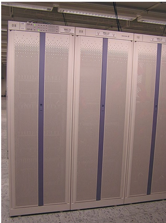
Fig 17.1 AXE system.

The analog system uses an electric current to convey the vibrations of the human voice, whereas a digital system uses a stream of binary digits to represent sound. The AXE system was an immediate success with telecom companies, and it was