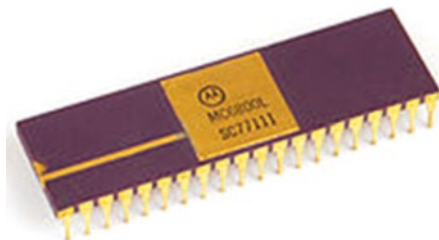
Fig. 10.2 Motorola 6800 microprocessor

and video games. It contained over 4000 transistors. It competed against the Intel 8080 microprocessor, and it was used in some early home computer kits.