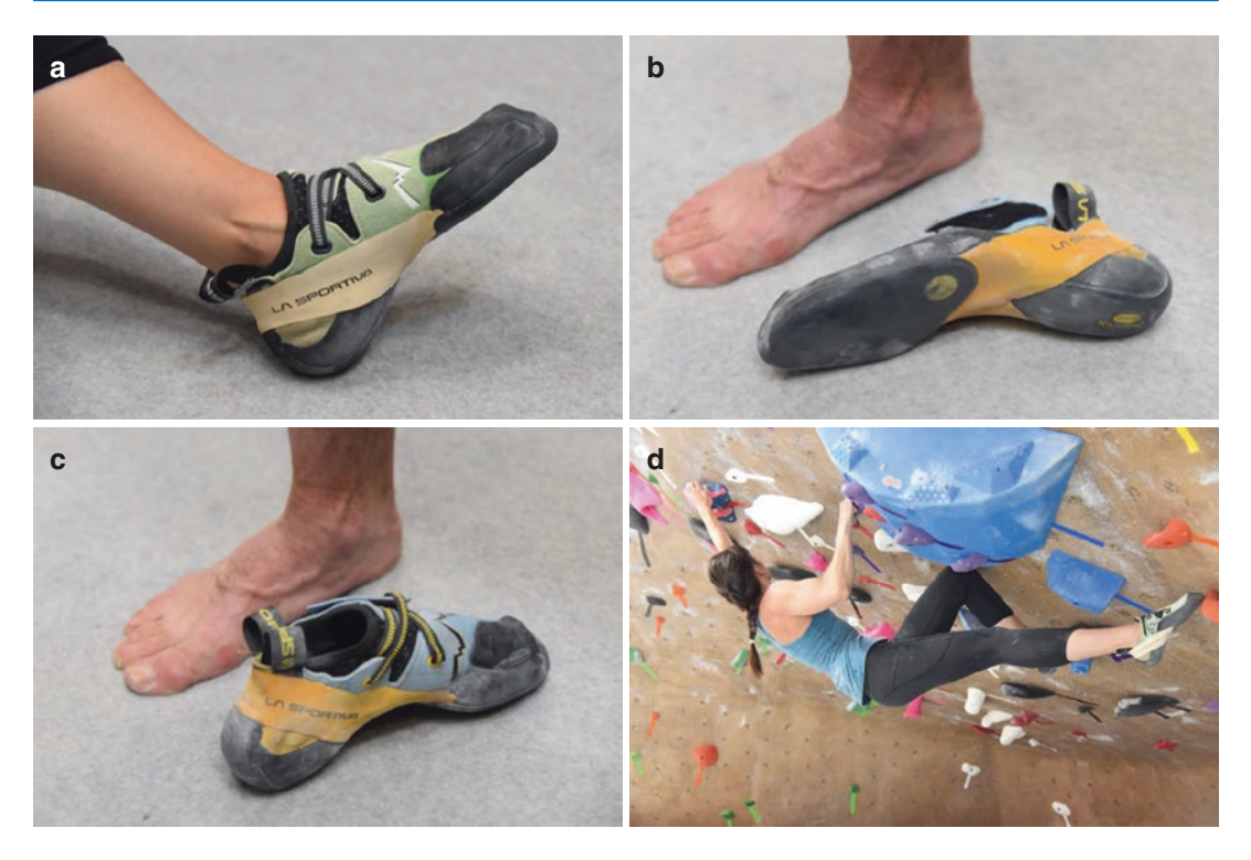
Fig. 14.5 Variations of the climbing shoe. (a) Shows a moderate arch exaggeration with a prominent hooked distal toe. (b, c) Show various angles of a high arch variation with

ronments. Frost bite, cerebral edema, pulmonary edema, altitude sickness, snow blindness, heat exhaustion, dehydration—an awareness of these medical issues must be a part of the medical knowledge of the physician hoping to take care of the climbing community.