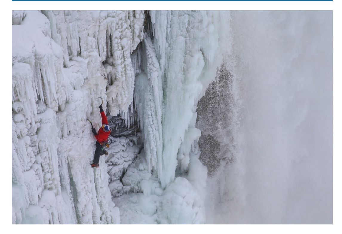
Fig. 14.1 Ice climbing a frozen Niagara Falls

ropes and can consequently have the highest risk of falls and traumatic lower extremity injuries. Additionally, bouldering involves more explosive positions and higher loads and can therefore lead to more tendinopathies and overuse injuries as well. Climbing is generally performed with a belayed rope attached to another person, or to equipment that acts as a safeguard in the event of a fall. The majority of falls in climbing are wall collisions rather than ground falls, which is contrary to public perception [3]. A wall collision is when the climber falls a short distance, is caught by their safety belay rope, then swings into the wall, colliding side on with the wall. A ground fall is, as it sounds, a fall from height on to the ground.