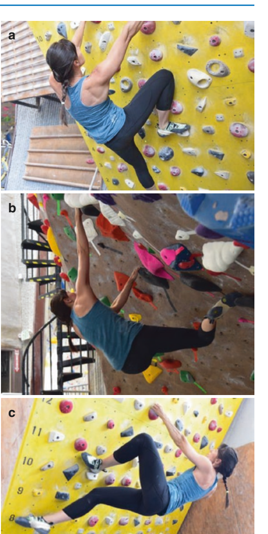
Fig. 14.4 Various common knee positions in climbers. (a) The high step position, (b) the drop knee position, (c) the heel hook

The heel hook position is a cause of posterior cruciate ligament (PCL) injuries in climbers [33]. While PCL injuries generally occur with a posterior directed force on a flexed knee [34], the heel