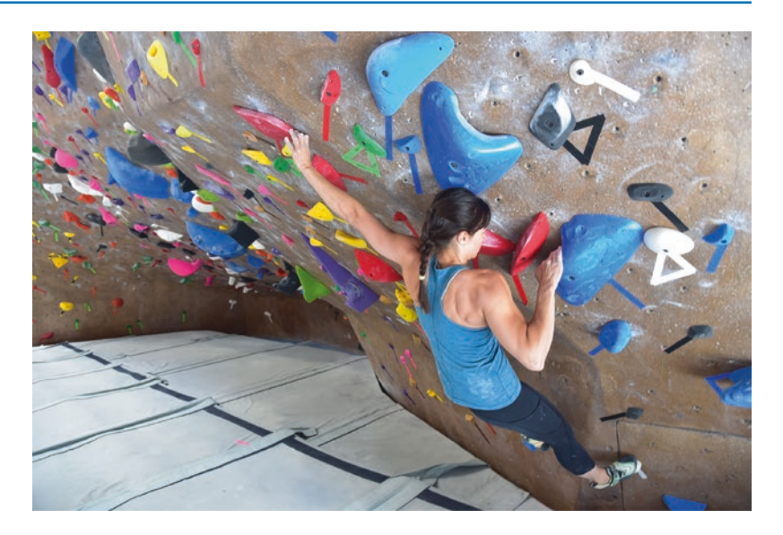
Fig. 14.2 The climbers left shoulder demonstrating the gaston position. This is a common shoulder position in climbers requiring extreme internal rotation while abducting and extending. It can be a source of anterior shoulder tendonitis as well as irritation of labral injuries