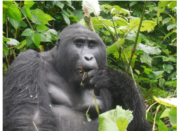
Fig. 1 Photograph of a mountain gorilla at Bwindi Impenetrable National Park, Uganda

National Park in southwestern Uganda, with the remainder inhabiting the Virunga Volcanoes Mountain Range that spans Rwanda, the Democratic Republic of Congo (DRC), and Mgahinga National Park in Uganda. The IUCN status of the mountain gorilla was downlisted from critically endangered to endangered in 2018 due to positive growth trends over the past two decades. The mountain gorilla is also the only gorilla subspecies in recorded history to demonstrate a rise in population this century, from 650 in 1998 to 1063 in 2018 (Hickey et al. 2018) (Figs. 1 and 2).