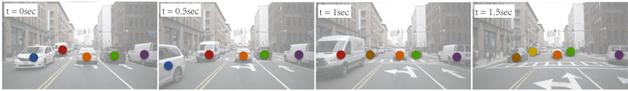
Fig. 1. We track objects by tracking their centers. We learn a 2D offset between two adjacent frames and associate them based on center distance.

combining ideas from point-based tracking and simultaneous detection and tracking further simplifies tracking.