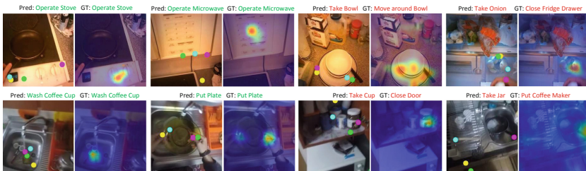
Fig. 3. Visualization of motor attention (left image), interaction hotspots (right image), and action labels (captions above the images) on sample frames from EGTEA (first row) and EPIC-Kitchens (second row). Both successful (green label) and failure cases (red label) are shown. Future hands position are predicted at every 8 frames and plotted on the last observable frame with the order of yellow, green, cyan, and magenta. (Color figure online)

The results are presented in Table 5. Our model outperforms Kalman filter and GPR, yet is slightly worse than LSTM model (+0.01 in both errors). Note that all baseline methods need the coordinate of the first observed hand for prediction. This simplifies trajectory prediction into a less challenging regression problem. In contrast, our model does not need hand coordinates for inference. A model that relies on the observation of hand positions will encounter failure cases when the hand has not been observed, while our model is still capable of “imagining” the possible hand trajectory. See “Operate Microwave” and “Wash Coffee Cup” in Fig. 3 for example results from our model.