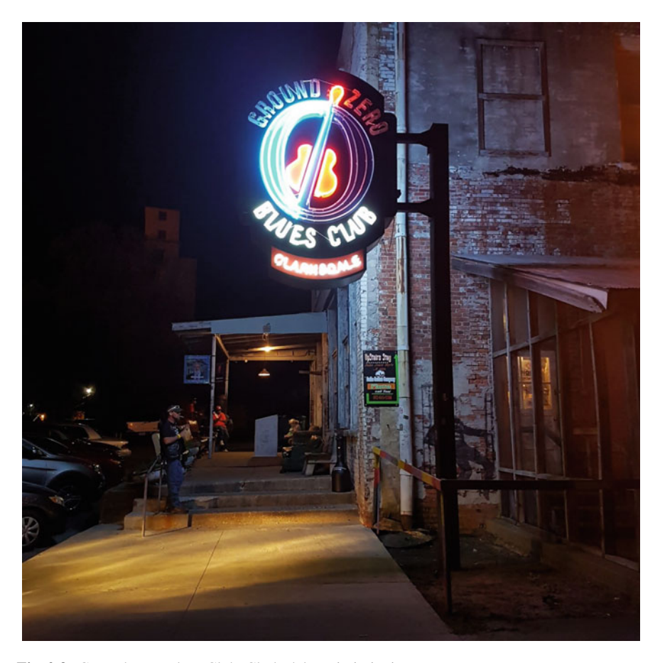
Fig. 2.3 Ground Zero Blues Club, Clarksdale, Mississippi

Juke Joints—described as 'cheap rent' informal venues for eating, drinking, and dancing to a juke box or live music—are a feature of Clarksdale's blues scene. Principal among them is Red's Lounge, a rather dilapidated building located on Sunflower Avenue, but certainly a long-established and renowned focus for live blues music (see Fig. 2.4). Other live music venues include Ground Zero Blues Club, New Roxy, Bluesberry Café, Cathead, Hambone Art & Music, Delta Blues Alley Café, Levon's, Hooker Grocery & Eatery, Grandma's Sports Bar, and Messenger's. Live music is also available at a number of downtown restaurants on a regular basis, and out at the Shack Up Inn and at Hopson Commissary on Highway 49.