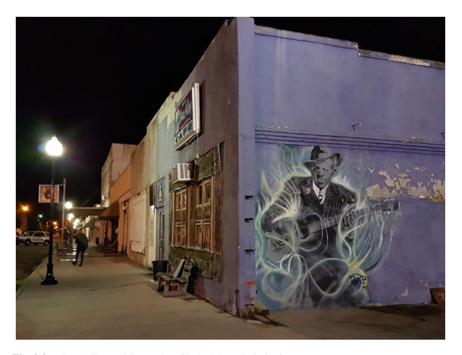
Fig. 2.2 Blues Alley and Street Art, Clarksdale, Mississippi

Today, positive results from the regeneration efforts are evident, with increasing numbers of new businesses and jobs; improved levels of service; refurbishment of derelict buildings; a renewed sense of place; and an uplift in community confidence.