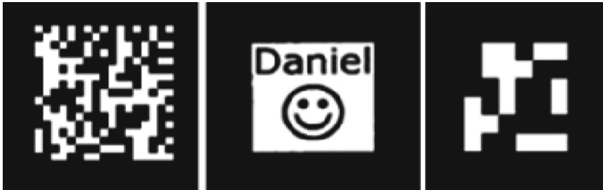
Fig. 2. Examples of markers

A first approach of tracking said markers uses easily recognizable patterns [34] whose major advantage is that they are not excessive in terms of computing power because the analysis of a single image can detect the position of markers. Figure 2 shows some examples of markers used.