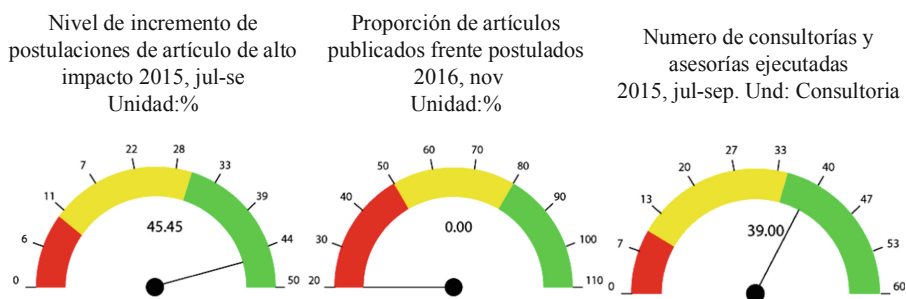
Fig. 4. Screenshot of indicators display (Color figure online)

On the other hand, there is a report on the indicators history, where the different measures that an indicator has had throughout its existence are displayed on a graph. This allows to know if the indicator is growing or decreasing, in order to take corrective measures or to design strategies that allow to achieve the goals. For this reason, in this report the goal to be achieved can be seen, in each one of the graphs of the indicator. Finally, Fig. 4 shows the report of the current status of the indicators, where a semaphore is displayed that indicates the limits of the tolerance ranges of the indicator and its current measurement.