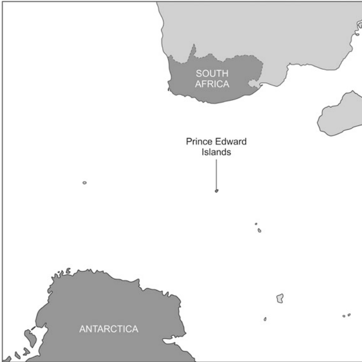
Fig. 8.2 Position of the sub-Antarctic Prince Edward Islands in the Southern Ocean

Despite their isolation and their harsh climates, sub-Antarctic islands, including the PEIs, have not remained unaffected by humans, and biological invasions have had a major impact on their ecology. Indeed, it has been established that whereas sub-Antarctic islands with milder temperatures tend to support more invasive species (Chown et al. 1998; Leihey et al. 2018), the harsh climate of these islands does not provide a barrier to the survival of a significant number of global invaders (Steyn 2017; Duffy et al. 2017).