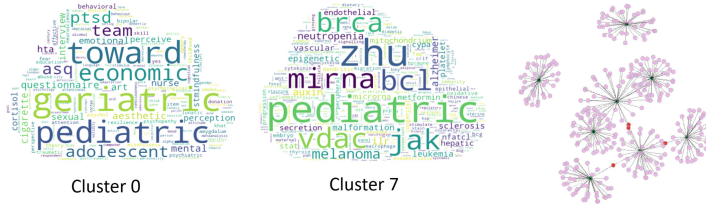
Fig. 3. TF-IDF weighting schemas with K=8 . Word-clouds of Cluster0 and Cluster7 (Left) and graph visualisation using the top-40 frequent words (Right)