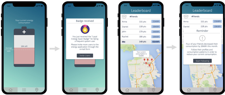
Fig. 1. Sample story-board (Reciprocity – left; Liking – right)