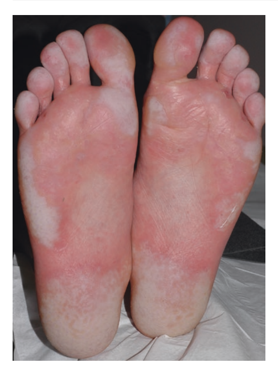
Fig. 12.1 Hyperhidrosis of the feet