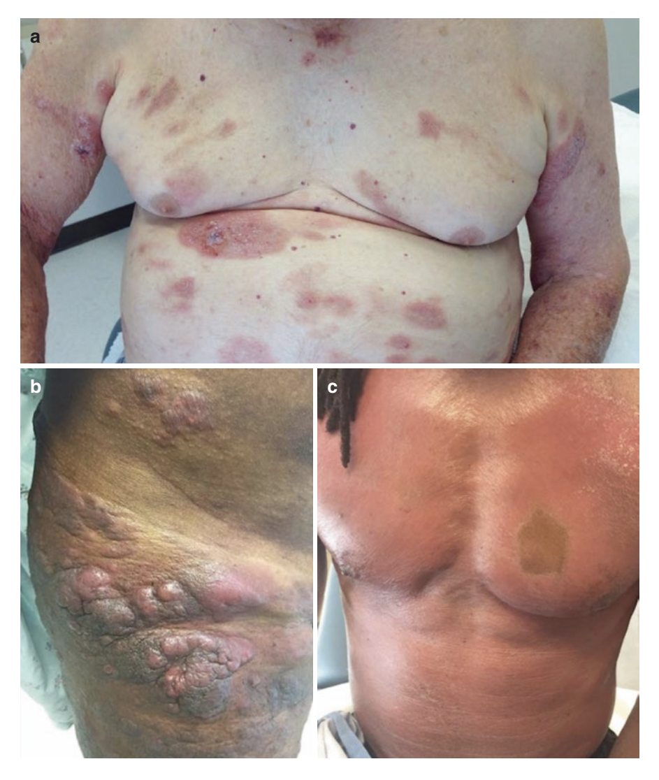
Fig. 14.2 Clinical T stage mycosis fungoides. (a) Patches and plaques of mycosis fungoides (Stage T2 disease). (b) Tumor-stage (T3) mycosis fungoides. (c) Erythroderma associated with mycosis fungoides (Stage T4 disease).