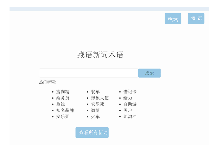
Fig. 3. Chinese version of the home page.