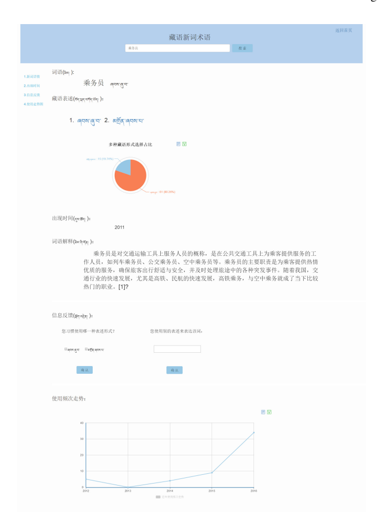
Fig. 5. Search results page.