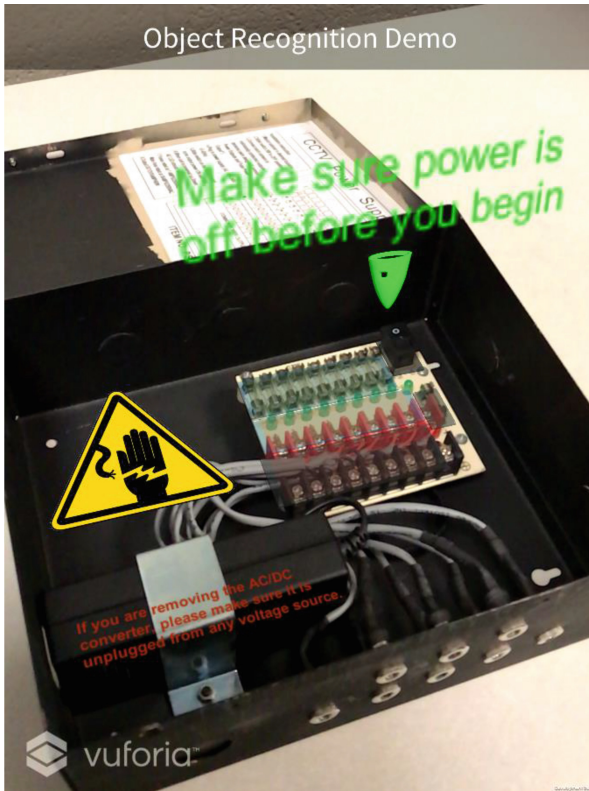
Fig. 2. Screenshot of the labeled electrical box application. The user may tap on one of the color-coded sections to obtain additional information.

were moving in the right direction. This example highlighted another UI issue, however, as the electrical box is difficult to open and often requires two hands. Since the user is holding the device and has only one hand available, this made some users reluctant to put down the device and thus, continued to struggle to open the electrical box with one hand.