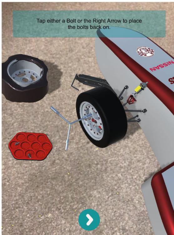
Fig. 1. Screenshot of the tire change application. The user must tap an unattached lug nut or the right arrow at the bottom of the screen to move to the next step.

The tire change application was developed as a continuation of an earlier MAR application designed for the Mississippi State University Formula SAE team. The previous application used MAR to create the appearance of a virtual model of the team's competition vehicle in the real world. This application was used to educate users on the features and design of the vehicle. The modified application provides interactive instructions for the process of changing a flat tire on the virtual vehicle by walking the user through the procedure step-by-step in MAR (see Fig. 1). In MAR, the user acts on the virtual vehicle with virtual parts and virtual tools presented at a 1:1 scale.