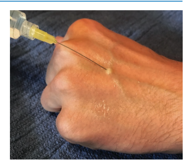
Fig. 6.3 Injection of local anesthetic into subcutaneous tissue to alleviate pain during peripheral IV insertion

Fig. 6.4 Angulation of angiocatheter as it passes through skin