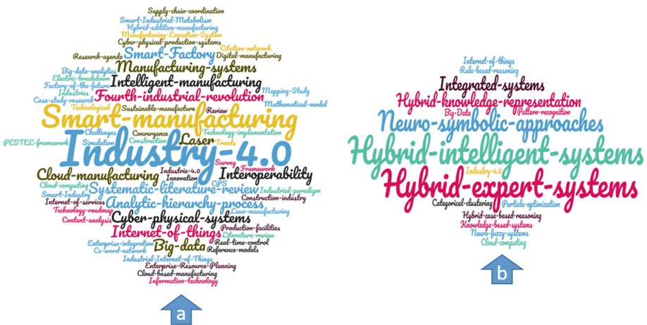
Fig. 2. (a) Cloud of the keywords found in articles classified by search ID B1. (b) Cloud of the keywords found in articles classified by search ID B2–B3.