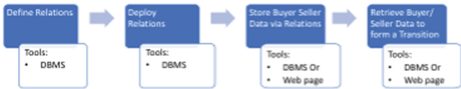
Fig. 1. Data storage and retrieval with MySQL

As in any relational database, the data structures in MySQL are to be represented via relations (i.e., tables in a database). As shown in Fig. 1, the process starts with: