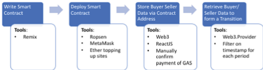
Fig. 3. Data storage and retrieval with Blockchain. Note: Tools listed here were used in this experiment, other tools could be chosen instead.