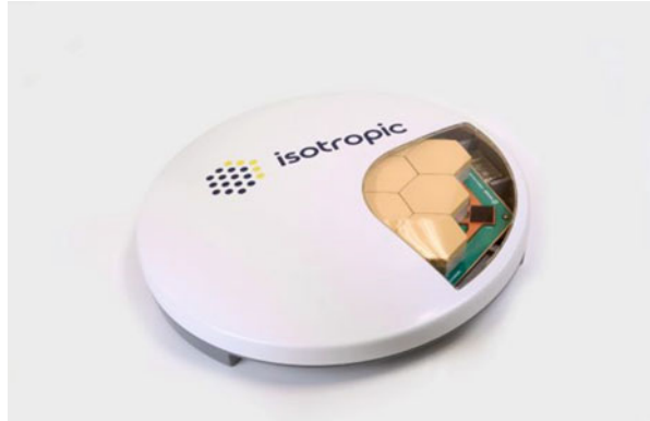
Fig. 5 Isotropic Systems flat panel satellite antenna.