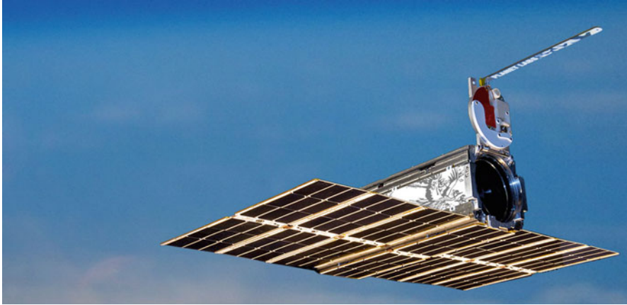
Fig. 3 The Planet LLC Dove 3 U Cube Satellite has now had 18 generations of design innovation and in-orbit testing.

Those commercial systems that are deploying hundreds if not thousands of telecommunications or networking minisats for large-scale constellations (i.e., smallsats in the 100–500 kg class) might require more homogenous designs and more quality testing in their approach to satellite production than that used by Planet or Spire. Nevertheless, their design, manufacture, and testing operations will tend to be more like the production of a television set or aircraft, than a handcrafted electronic product that goes through years of quality testing as was the case with large GEO satellites. In essence, part of the small satellite revolution has come from entrepreneurial insight and even rebelliousness that has concluded the ways of the past are no longer the best way forward. Small satellites such as the Planet Dove, produced in large numbers for LEO constellations, can lead to faster rates of innovation, more in-orbit testing, new modes of production, and even competitive designs (Fig. 3).