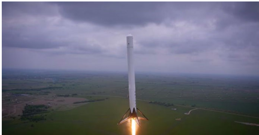
Fig. 4 Test flight of the Falcon 9 Reusable (F9R) launcher that promises new economies for smallsat launches.

launch arrangements for small satellites is not only that of the convenient availability of launch dates, but it is also cost-effectiveness and reliability of the launcher services. There are indications that larger launch systems might be able to respond effectively to all three aspects of convenience of scheduling, cost competitiveness, and reliability of service.