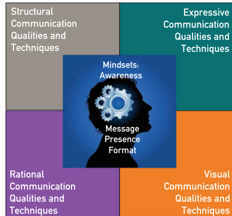
Eight Communication Intelligence Elements: Four Mindsets and Four Technique Clusters

involved in communication as well as oneself; and also be aware of the situation, context or purpose of the communication activity (e.g. informing, inquiring, influencing, persuading, entertaining, motivating, inspiring, brainstorming). For example, in innovation leadership communication, the “awareness mindset” is reflected in: a desire to involve others, and to take account of the diversity effects (e.g. culture, gender, generational cohort) that would influence the communication interactions (transmission and interpretation); understanding the likely motivators, language and themes that will be relevant to others; and considering cultural context or physical environment when planning activities such as brainstorming or innovation evaluation discussions.