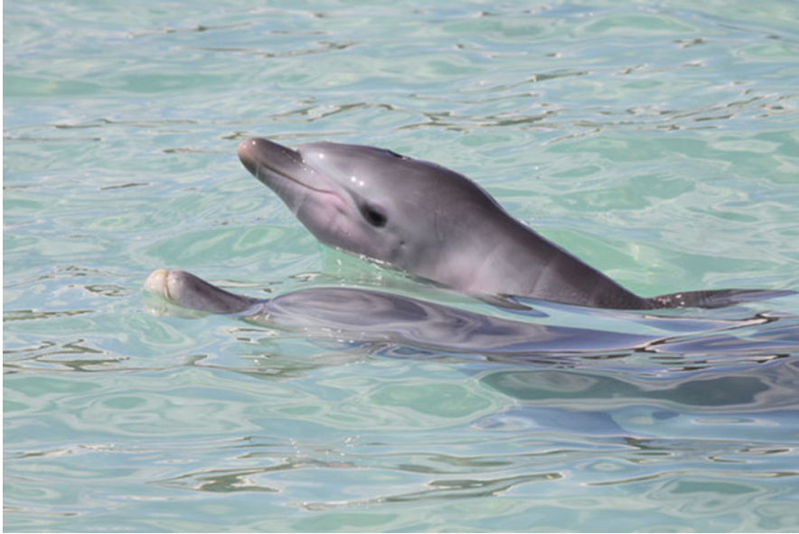
Fig. 5.1 Indo-Pacific bottlenose dolphin, Tursiops aduncus , newborn swimming in echelon with her mother. Fetal lines are visible. Calf is doing a “chin up” surfacing characteristic of very young calves as they lift the blowhole out of the water.