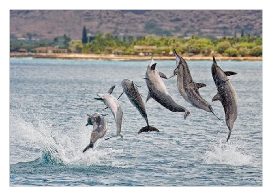
Fig. 17.3 A collated sequence of a spinner dolphin, Stenella longirostris , performing a spinning leap. In this compilation of a video sequence, the leap begins on the right side, and the dolphin turns on its axis two times, until it lands to the left. Leaps can be in this vertical stance, but also horizontally to the water, and can incorporate over three turns of the body axis while in-air

Spinner dolphins engage in a wide range of above-water behaviors, spanning from subtle "nose-outs," whereby the rostrum is extended just above the water's surface, to high-energy "tail-over-head" leaps, in which the dolphin throws its tail forward in a somersault (Norris and Dohl 1980). Aerial behaviors can occur at any time but are most common during periods of socializing and traveling. They are least common during periods of rest, although individuals in a resting group may leap or spin in response to an approaching vessel, as if to alert the vessel of the pod's presence. The variety, intensity, and frequency of aerial activities, combined with other behavioral metrics, can thus be used as indicators of a spinner dolphin pod's behavioral state (Lammers 2004).