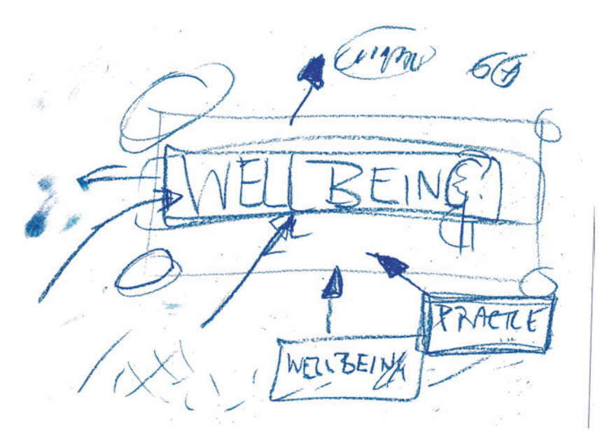
Fig. 1 'Wellbeing' (Senior Lecturer in Anthropology, dance)

INT: I can see your whole face changes when you're thinking about that and your eyes light up and a huge smile on your face, I guess that's what it means to you, it was prioritising yourself as well which is quite hard if you're a parent, particularly a single parent... you tend to be at the bottom of the pile, don't you?