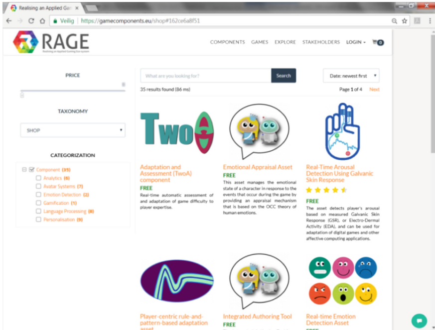
Fig. 2. A screenshot of the software catalogue at the marketplace portal ( gamecomponents.eu ).