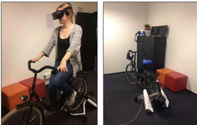
Fig. 2 Bike connected to the VR system