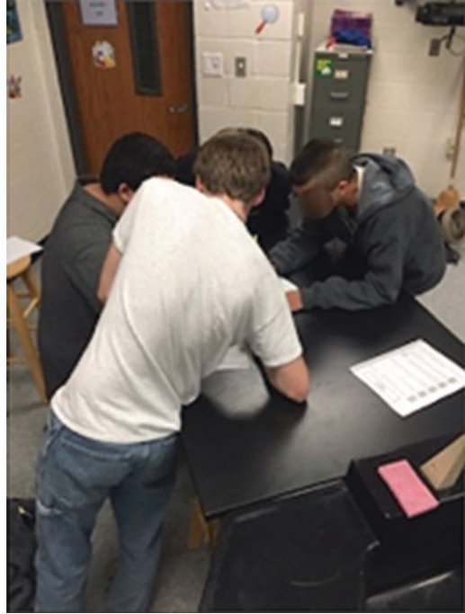
Fig. 14.3 “In a unisex class, we always thought that we were bigger than each other. Our egos were high”