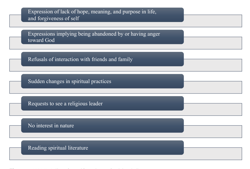
Fig. 1.4 NANDA list of manifestations of spiritual distress

meaningfulness, inner peace, love and connection with a transcendent. This is magnified during the experience of illness or a traumatic life event due to feelings of loss and change, which can also initiate a search for meaning and raise existential questions [71]. Furthermore, individuals can experience a realisation of mortality; a feeling of powerlessness and vulnerability; an isolation and loneliness; and feelings of guilt or shame [71]. Thus, losses and changes to which a patient cannot assign meaning or reconcile with basic beliefs about the world will contribute to spiritual distress. Being unable to sense that one's existence will continue in some manner after death may also exacerbate spiritual distress. Unanswered existential questions, a continued sense of vulnerability, loneliness, and guilt may have the same effect [71]. Unlike physical or psychological symptoms, spiritual distress may not always