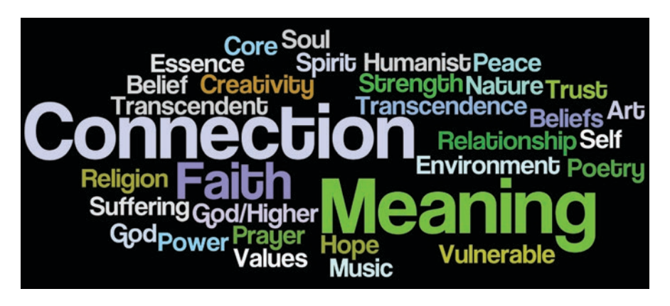
Fig. 1.2 Words used to describe spirituality

Chaplaincy is central to the delivery of spiritual care. However, chaplaincy is not the only discipline that benefits from understanding and recognising what spirituality is and how it functions in the lives of people experiencing illness and distress. Spirituality is important for all healthcare professionals. However, chaplains should be recognised as experts in the provision of spiritual care and also provide expertise and education to other healthcare professionals. Fourthly, spirituality is not only important for patients – it is important for all persons. Healthcare professionals are spiritual people, and learning to work with one's own spirituality within a caring context is a vital tool for the delivery of holistic care; to care well, one needs to be cared for well. Finally, spirituality is not about imposing your own beliefs and values on another. Although the spirituality of carers is important and needs to be considered, this does not mean that it is in any way appropriate for carers to impose their values and beliefs on patients in situations where they are clearly vulnerable.