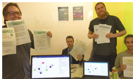
Fig. 2. A project team showing their practice cards

This approach, in practice, resulted in the teams largely working with various “ScrumBut” 2 approaches for the first three weeks. Their use of Scrum was likely to have stemmed from a previous course at the university having introduced them to Scrum. After three weeks of working as they saw fit without outside assistance from the teaching team, the teams were introduced to the Ivar Jacobson Practice Library 3 . They were tasked with using the practice cards (Fig. 2) from the library to re-construct their way of working and to modify it as they saw fit based on their experiences so far.