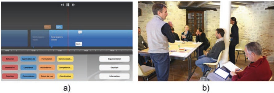
Fig. 2 MM-Record tool on tablet (a) and its use during a 2017 TATA-BOX design meeting (b)

MM-Record (Fig. 2) completes the audio recording of meetings by allowing participants to index the audio content with coloured marks and tags for time, speakers’ names, and categories, and to design rationale topics. In the abundant records of the 2017 TATA-BOX meetings (lasting many hours), it helped actors to retrieve