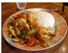
Question: Which object in the image can be used to eat with? Relation: UsedFor Associated Fact: (Fork, UsedFor, Eat) Answer Source: Image Answer: Fork