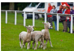
Question: What do the animals in the image eat? Relation: RelatedTo Associated Fact: (Sheep, RelatedTo, Grass Eater) Answer Source: Knowledge Base Answer: Grass