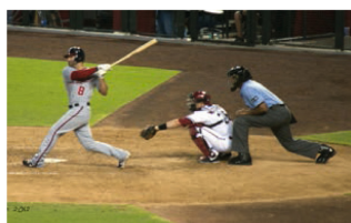
Question: Which equipment in this image is used to hit baseball? Relation: CapableOf Associated Fact: (Baseball bat, CapableOf, Hit a baseball) Answer Source: Image Answer: Baseball bat