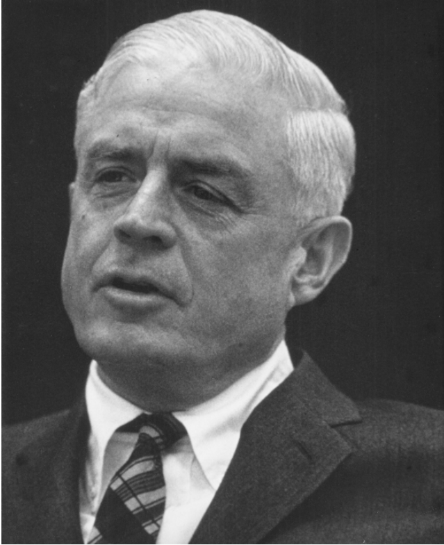
Fig. 7.5 Thomas Watson Jr

calculations per second. It used a 36-bit word and had an address-space of 32,768 words. It was used by the US Air Force to provide an early warning system for missiles and also by NASA to control space flights. It cost approximately $3 million but it could be rented for over $60 K per month.