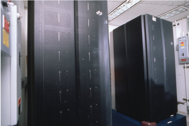
Fig. 7.8 Deep Blue Processors

The Year-2000 millennium bug generated significant customer demand in the late 1990s, as customers wished to ensure that their software was compliant and would continue to function correctly in the new millennium. January 1, 2000 went smoothly for most companies as they had converted their legacy software systems to be Year-2000 compliant.