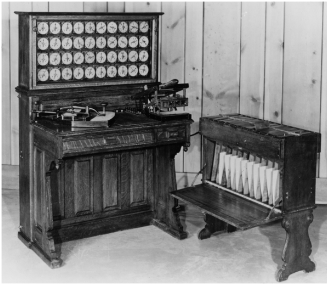
Fig. 7.2 Hollerith's Tabulator (1890)

His punch card Tabulating Machine used an electric current to sense holes in punched cards, and it kept a running total of the data (Fig. 7.2). His machine used Babbage's idea of punched cards for data storage. The new methodology enabled the results of the 1890 census to be available within 6 weeks, and the population was recorded to be over 62 million.