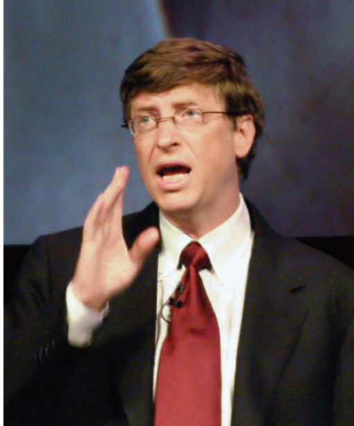
Fig. 7.9 Bill Gates

Microsoft purchased a CP/M clone called QDOS to assist with this, and IBM renamed the new operating system to PC-DOS. Microsoft created its own version of the operating system called MS-DOS, and the deal with IBM allowed Microsoft to have control of its own QDOS derivative. This proved to be a major mistake by IBM, as MS-DOS became popular in Europe, Japan and South America. The flood of PC clones on the market allowed Microsoft to gain major market share through aggressive marketing of its operating system to the various manufacturers of the cloned PCs. This led to Microsoft becoming a major player in the personal computer market.