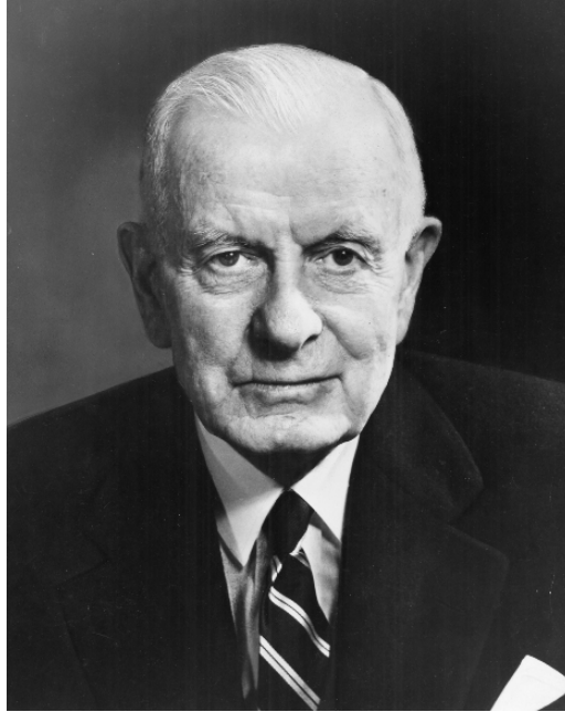
Fig. 7.3 Thomas Watson Sr

a net income of $2 million. It had manufacturing plants in the United States and Europe. By 2005, IBM had revenues of $91.1 billion, net income of $7.9 billion, and it employed over 300,000 people.