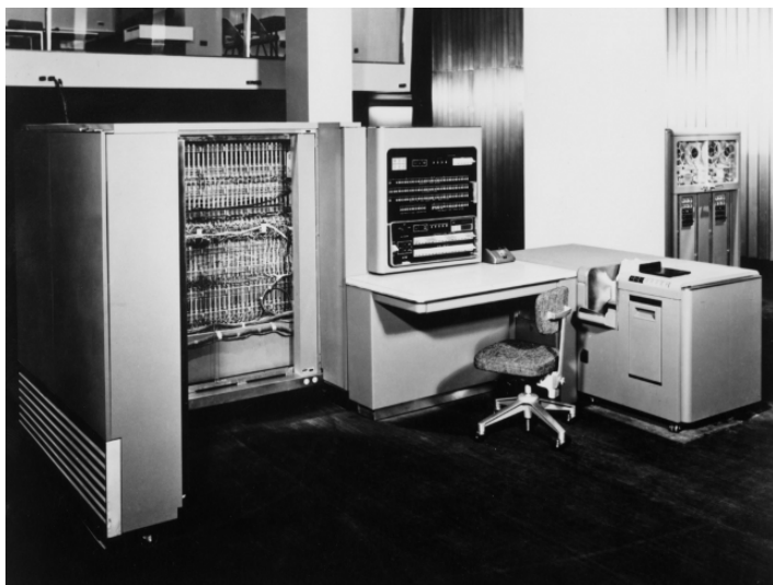
Fig. 7.4 IBM 701

The IBM 704 data processing system was a large computer that was introduced in 1954. It included core memory and floating-point arithmetic, and was used for both scientific and commercial applications. It included high speed memory which was faster and much more reliable than the cathode-ray-tube memory storage mechanism employed in earlier machines. It also had a magnetic drum storage unit which could store parts of the program and intermediate results.