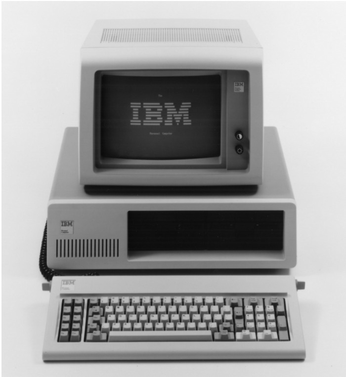
Fig. 7.7 IBM Personal Computer

IBM had traditionally produced all of the components for its machines. However, it outsourced the production of components to other companies for the IBM PC. The production of the processor chip was outsourced to a company called Intel, 4 and the development of the Disk Operating System (DOS) was outsourced to a small company called Microsoft. 5 These two companies would later become technology giants.