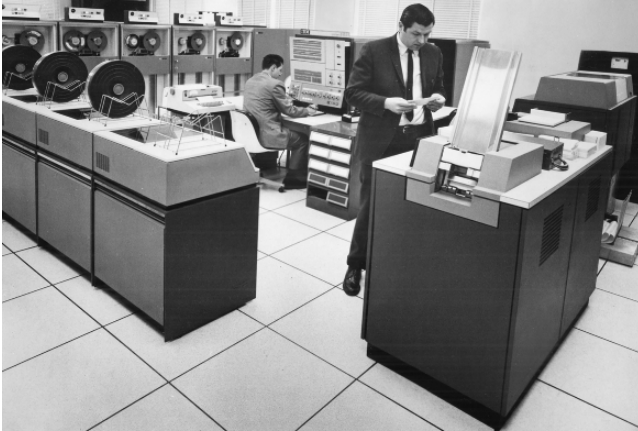
Fig. 7.6 IBM 360 Model 30

different operating systems, with the smaller machines having a very basic operating system, the mid-range using an operating system called DOS, and the larger systems using an operating system called OS/360. The System 360 also gave significant performance gains, as it included IBM-designed solid logic technology. This allows denser and faster circuits than earlier transistors, and was over 1,000 times more reliable than vacuum tubes.